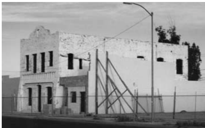
The old Odd Fellows' Hall in Chandler, AZ, built in 1928 (above), has been restored to become the home for McCormick Systems (left).

"It had been abandoned for about a decade, and we knew